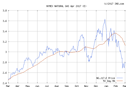
Above Graph—Apr 2017 NYMEX gas futures

The Crude oil price for April is lower this week at $52.93 per barrel. Heating oil is lower at $1.62 per gal. Unleaded gasoline futures are higher this week at $1.64 and gasoline at the pump is around $2.19...in Indiana. The natural gas storage report this week was an injection of 7BCF ; storage is 187BCF lower than last year and 295BCF higher than the 5 year average.