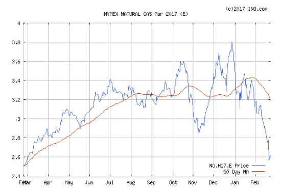
Above Graph—Mar 2017 NYMEX gas futures

The Crude oil price for March is higher this week at $54.36 per barrel. Heating oil is higher at $1.67 per gal. Unleaded gasoline futures are higher this week at $1.55 and gasoline at the pump is around $2.25...in Indiana. The natural gas storage report this week was a withdrawal of 89BCF ; storage is 261BCF lower than last year and 156BCF higher than the 5 year average.