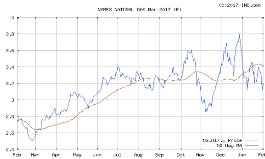
Above Graph—Mar 2017 NYMEX gas futures

The Crude oil price for March is lower this week at $53.78 per barrel. Heating oil is lower at $1.61 per gal. Unleaded gasoline futures are lower this week at $1.52 and gasoline at the pump is around $2.09...in Indiana. The natural gas storage report this week was a withdrawal of 87BCF ; storage is 266BCF lower than last year and 59BCF higher than the 5 year average.