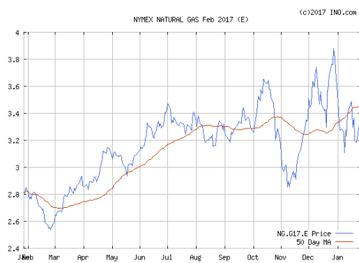
Above Graph—Feb 2017 NYMEX gas futures

The Crude oil price for February is higher this week at $53.89 per barrel. Heating oil is higher at $1.64 per gal. Unleaded gasoline futures are lower this week at $1.54 and gasoline at the pump is around $2.09...in Indiana. The natural gas storage report this week was a withdrawal of 119BCF ; storage is 348BCF lower than last year and 20BCF lower than the 5 year average.