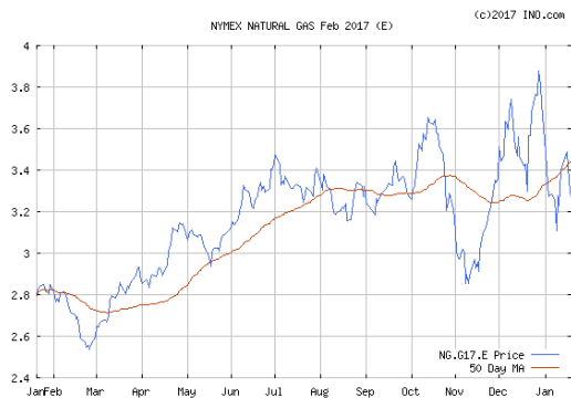
Above Graph—Feb 2017 NYMEX gas futures

The Crude oil price for February is lower this week at $52.46 per barrel. Heating oil is lower at $1.62 per gal. Unleaded gasoline futures are lower this week at $1.55 and gasoline at the pump is around $2.09...in Indiana. The natural gas storage report this week was a withdrawal of 243BCF ; storage is 431BCF lower than last year and 77BCF lower than the 5 year average.