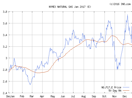
Above Graph—Jan 2017 NYMEX gas futures

The Crude oil price for January is higher this week at $52.91 per barrel. Heating oil is higher at $1.66 per gal. Unleaded gasoline futures are higher this week at $1.60 and gasoline at the pump is around $2.29...in Indiana. The natural gas storage report this week was a withdrawal of 209BCF ; storage is 226BCF lower than last year and 78BCF higher than the 5 year average.