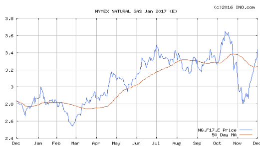
Above Graph—Jan 2017 NYMEX gas futures

The Crude oil price for January is higher this week at $50.82 per barrel. Heating oil is higher at $1.57 per gal. Unleaded gasoline futures are higher this week at $1.57 and gasoline at the pump is around $2.19...in Indiana. The natural gas storage report this week was an injection of 30BCF ; storage is 51BCF higher than last year and 216BCF higher than the 5 year average.