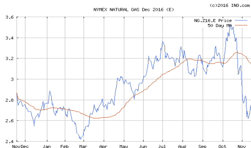
Above Graph—Dec 2016 NYMEX gas futures

The Crude oil price for December is higher this week at $45.79 per barrel. Heating oil is higher at $1.46 per gal. Unleaded gasoline futures are the same this week at $1.34 and gasoline at the pump is around $1.99...in Indiana. The natural gas storage report this week was an injection of 30BCF ; storage is 51BCF higher than last year and 216BCF higher than the 5 year average.