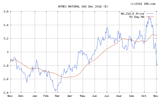
Above Graph—Dec 2016 NYMEX gas futures

The Crude oil price for December is lower this week at $44.75 per barrel. Heating oil is lower at $1.46 per gal. Unleaded gasoline futures are lower this week at $1.45 and gasoline at the pump is around $2.09...in Indiana. The natural gas storage report this week was an injection of 54BCF ; storage is 48BCF higher than last year and 173BCF higher than the 5 year average.