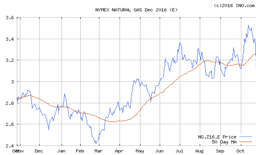
Above Graph—Dec 2016 NYMEX gas futures

The Crude oil price for December is lower this week at $49.50 per barrel. Heating oil is higher at $1.57 per gal. Unleaded gasoline futures are the same this week at $1.48 and gasoline at the pump is around $2.09...in Indiana. The natural gas storage report this week was an injection of 73BCF ; storage is 52BCF higher than last year and 182BCF higher than the 5 year average.