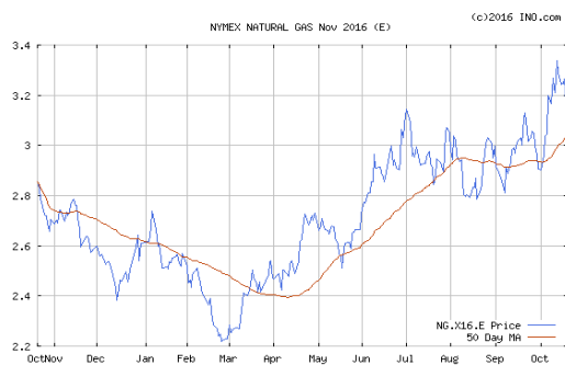
Above Graph—Nov 2016 NYMEX gas futures

The Crude oil price for November is higher this week at $50.54 per barrel. Heating oil is the same at $1.56 per gal. Unleaded gasoline futures are the same this week at $1.48 and gasoline at the pump is around $1.99...in Indiana. The natural gas storage report this week was an injection of 77BCF ; storage is 46BCF higher than last year and 185BCF higher than the 5 year average.