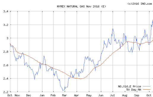
Above Graph—Nov 2016 NYMEX gas futures

The Crude oil price for November is lower this week at $50.36 per barrel. Heating oil is lower at $1.58 per gal. Unleaded gasoline futures are lower this week at $1.48 and gasoline at the pump is around $2.29...in Indiana. The natural gas storage report this week was an injection of 79BCF ; storage is 56BCF higher than last year and 192BCF higher than the 5 year average.