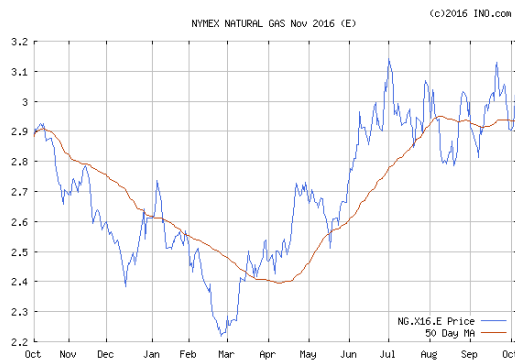
Above Graph—Nov 2016 NYMEX gas futures

The Crude oil price for November is higher this week at $50.44 per barrel. Heating oil is higher at $1.60 per gal. Unleaded gasoline futures are higher this week at $1.50 and gasoline at the pump is around $2.29...in Indiana. The natural gas storage report this week was an injection of 80BCF ; storage is 74BCF higher than last year and 205BCF higher than the 5 year average.