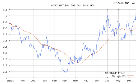
Above Graph—Oct 2016 NYMEX gas futures

The Crude oil price for October is higher this week at $46.27 per barrel. Heating oil is higher at $1.46 per gal. Unleaded gasoline futures are higher this week at $1.41 and gasoline at the pump is around $2.19...in Indiana. The natural gas storage report this week was an injection of 52BCF ; storage is 140BCF higher than last year and 268BCF higher than the 5 year average.