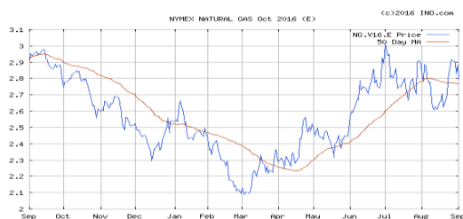
Above Graph—Oct 2016 NYMEX gas futures

The Crude oil price for October is lower this week at $43.48 per barrel. Heating oil is lower at $1.38 per gal. Unleaded gasoline futures are lower this week at $1.28 and gasoline at the pump is around $2.19...in Indiana. The natural gas storage report this week was an injection of 51BCF ; storage is 238BCF higher than last year and 334BCF higher than the 5 year average.