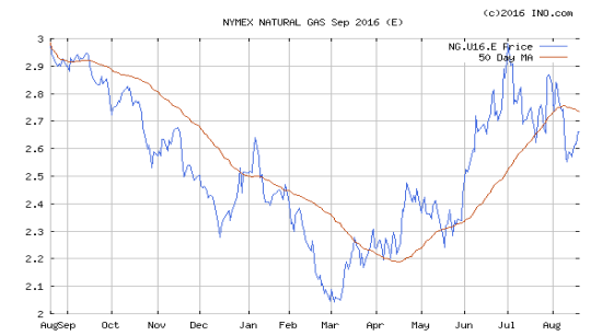
Above Graph—Sep 2016 NYMEX gas futures

The Crude oil price for September is higher this week at $48.95 per barrel. Heating oil is higher at $1.52 per gal. Unleaded gasoline futures are higher this week at $1.49 and gasoline at the pump is around $2.13...in Indiana. The natural gas storage report this week was an injection of 22BCF ; storage is 327BCF higher than last year and 405BCF higher than the 5 year average.