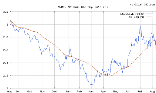
Above Graph—Sep 2016 NYMEX gas futures

The Crude oil price for September is lower this week at $41.82 per barrel. Heating oil is higher at $1.33 per gal. Unleaded gasoline futures are lower this week at $1.29 and gasoline at the pump is around $2.03...in Indiana. The natural gas storage report this week was an injection of 29BCF ; storage is 361BCF higher than last year and 440BCF higher than the 5 year average.