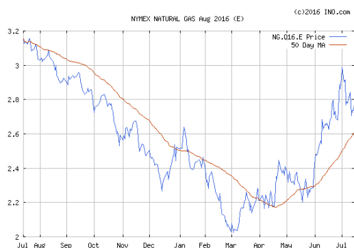
Above Graph—Aug 2016 NYMEX gas futures

The Crude oil price for August is lower this week at $46.05 per barrel. Heating oil is lower at $1.40 per gal. Unleaded gasoline futures are lower this week at $1.41 and gasoline at the pump is around $2.09...in Indiana. The natural gas storage report this week was an injection of 64BCF ; storage is 507BCF higher than last year and 586BCF higher than the 5 year average.