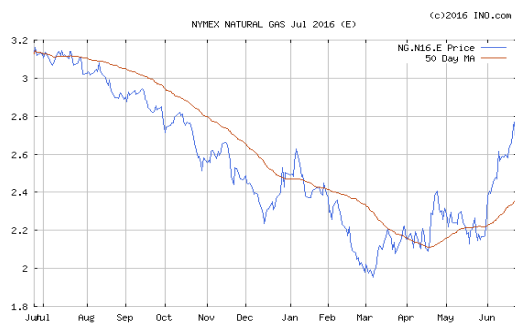
Above Graph—July 2016 NYMEX gas futures

The Crude oil price for July is higher this week at $49.68 per barrel. Heating oil is higher at $1.50 per gal. Unleaded gasoline futures are higher this week at $1.59 and gasoline at the pump is around $2.49...in Indiana. The natural gas storage report this week was an injection of 62BCF ; storage is 618BCF higher than last year and 678BCF higher than the 5 year average.