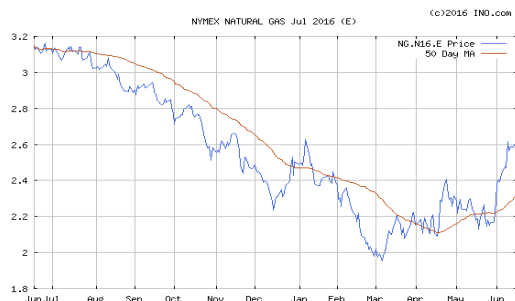
Above Graph—July 2016 NYMEX gas futures

The Crude oil price for July is lower this week at $46.49 per barrel. Heating oil is lower at $1.43 per gal. Unleaded gasoline futures are lower this week at $1.48 and gasoline at the pump is around $2.49...in Indiana. The natural gas storage report this week was an injection of 69BCF ; storage is 633BCF higher than last year and 704BCF higher than the 5 year average.