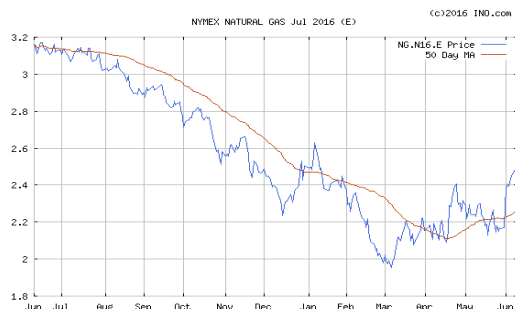
Above Graph—July 2016 NYMEX gas futures

The Crude oil price for July is higher this week at $50.69 per barrel. Heating oil is higher at $1.55 per gal. Unleaded gasoline futures are higher this week at $1.61 and gasoline at the pump is around $2.55...in Indiana. The natural gas storage report this week was an injection of 65BCF ; storage is 660BCF higher than last year and 722BCF higher than the 5 year average.