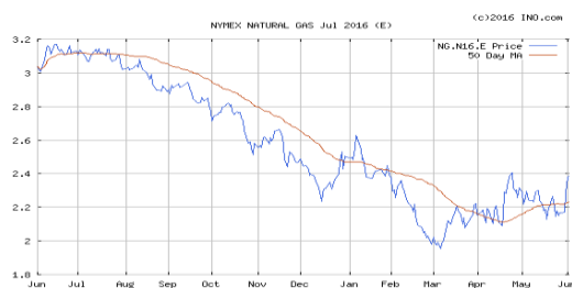
Above Graph - July 2016 NYMEX gas futures

The Crude oil price for July is lower this week at $48.14 per barrel. Heating oil is lower at $1.49 per gal. Unleaded gasoline futures are lower this week at $1.60 and gasoline at the pump is around $2.45...in Indiana. The natural gas storage report this week was an injection of 82BCF ; storage is 712BCF higher than last year and 753BCF higher than the 5 year average.