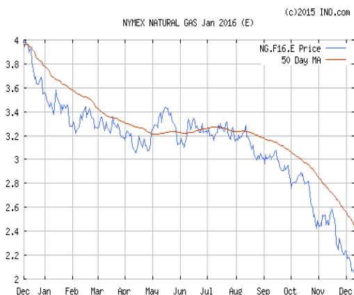
Above Graph—Jan 2016 NYMEX gas futures

The Crude oil price for January is lower this week at $36.98 per barrel. Heating oil is lower at $1.24 per gal. Unleaded gasoline futures are lower this week at $1.27 and gasoline at the pump is around $1.73...in Indiana. The natural gas storage report this week was a withdrawal of 76BCF ; storage is 514BCF higher than last year and 236BCF higher than the 5 year average.