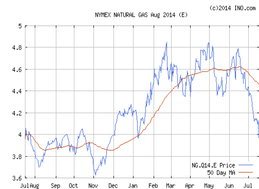
Above Graph – August 2014 NYMEX gas futures

The Crude oil price for Aug is higher this week at $103.06 per barrel. Heating oil is lower at $2.86 per gal. Unleaded gasoline futures are lower this week at $2.88 and gasoline at the pump is around $3.59...in Indiana. The natural gas storage report this week was an injection of 107BCF ; storage is 608 BCF lower than last year and 727BCF lower than the 5 year average.