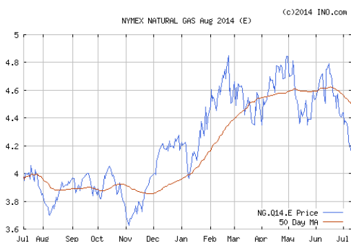
Above Graph – August 2014 NYMEX gas futures

The Crude oil price for Aug is lower this week at $102.40 per barrel. Heating oil is lower at $2.88 per gal. Unleaded gasoline futures are lower this week at $2.93 and gasoline at the pump is around $3.69...in Indiana. The natural gas storage report this week was an injection of 93BCF ; storage is 653 BCF lower than last year and 769BCF lower than the 5 year average.