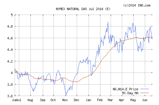
Above Graph – July 2014 NYMEX gas futures

The Crude oil price for July is higher this week at $106.61 per barrel. Heating oil is higher at $3.05 per gal. Unleaded gasoline futures are higher this week at $3.12 and gasoline at the pump is around $3.79...in Indiana. The natural gas storage report this week was an injection of 113BCF ; storage is 706BCF lower than last year and 851BCF lower than the 5 year average.