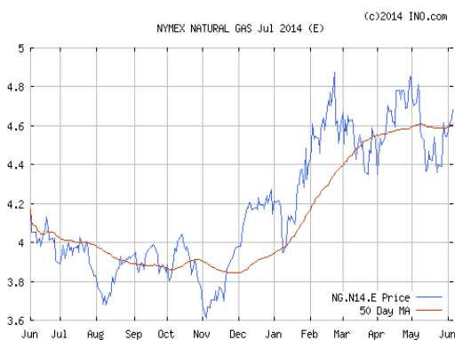
Above Graph – July 2014 NYMEX gas futures

The Crude oil price for July is lower this week at $102.49 per barrel. Heating oil is lower at $2.88 per gal. Unleaded gasoline futures are lower this week at $2.96 and gasoline at the pump is around $3.79...in Indiana. The natural gas storage report this week was an injection of 119BCF ; storage is 737BCF lower than last year and 896BCF lower than the 5 year average.