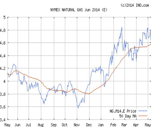
Above Graph – June 2014 NYMEX gas futures

The Crude oil price for June is higher this week at $100.37 per barrel. Heating oil is higher at $2.92 per gal. Unleaded gasoline futures are lower this week at $2.91 and gasoline at the pump is around $3.59...in Indiana. The natural gas storage report this week was an injection of 74BCF ; storage is 797BCF lower than last year and 982BCF lower than the 5 year average.