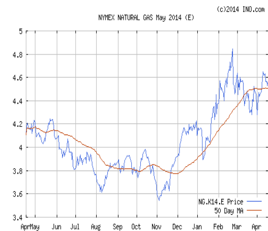
Above Graph – May 2014 NYMEX gas futures

The Crude oil price for May is higher this week at $103.92 per barrel. Heating oil is higher at $3.01 per gal. Unleaded gasoline futures are higher this week at $3.04 and gasoline at the pump is around $3.69...in Indiana. The natural gas storage report this week was an injection of 24BCF ; storage is 850BCF lower than last year and 1,010BCF lower than the 5 year average.