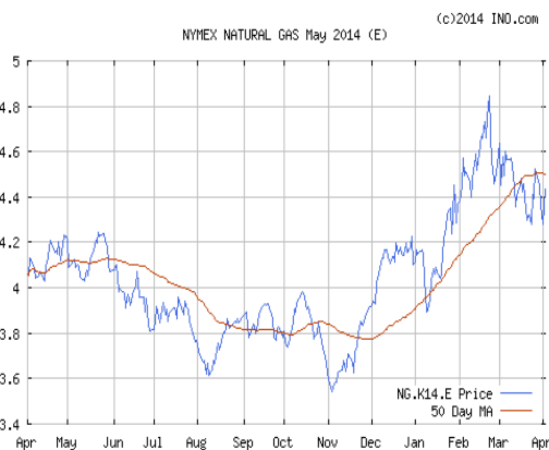
Above Graph – May 2014 NYMEX gas futures

The Crude oil price for May is lower this week at $100.08 per barrel. Heating oil is lower at $2.88 per gal. Unleaded gasoline futures are higher this week at $2.89 and gasoline at the pump is around $3.65...in Indiana. The natural gas storage report this week was a withdrawal of 74BCF ; storage is 878BCF lower than last year and 992BCF lower than the 5 year average.