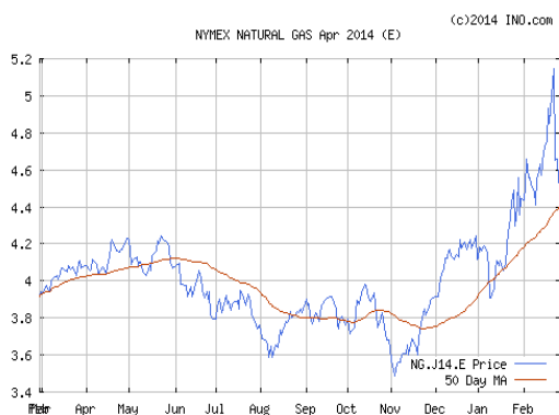
Above Graph – Apr 2014 NYMEX gas futures

The Crude oil price for April is lower this week at $102.17 per barrel. Heating oil is lower at $3.13 per gal. Unleaded gasoline futures are lower this week at $2.78 and gasoline at the pump is around $3.57...in Indiana. The natural gas storage report this week was a withdrawal of 95BCF ; storage is 905BCF lower than last year and 711BCF below than the 5 year average.