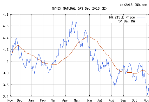
Above Graph – Dec 2013 NYMEX gas futures

The Crude oil price for Dec is lower this week at $93.93 per barrel. Heating oil is lower at $2.83 per gal. Unleaded gasoline futures are lower this week at $2.51 and gasoline at the pump is around $3.09...in Indiana. The natural gas storage report this week was an injection of 35BCF ; storage is 112BCF lower than last year and 57BCF above than the 5 year average.