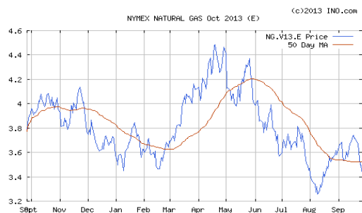
Above Graph – Oct 2013 NYMEX gas futures

The Crude oil price for Oct is lower this week at $102.79 per barrel. Heating oil is lower at $2.98 per gal. Unleaded gasoline futures are lower this week at $2.66 and gasoline at the pump is around $3.45...in Indiana. The natural gas storage report this week was an injection of 87BCF; storage is 179BCF lower than last year and 30BCF above than the 5 year average.