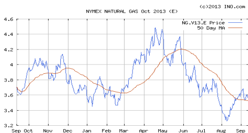
Above Graph – Oct 2013 NYMEX gas futures

The Crude oil price for Oct is higher this week at $108.26 per barrel. Heating oil is lower at $3.10 per gal. Unleaded gasoline futures are lower this week at $2.74 and gasoline at the pump is around $3.59...in Indiana. The natural gas storage report this week was an injection of 65BCF; storage is 172BCF lower than last year and 46BCF above than the 5 year average.