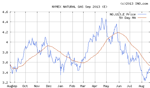
Above Graph – Sep 2013 NYMEX gas futures

The Crude oil price for Sep is lower this week at $104.26 per barrel. Heating oil is higher at $3.08 per gal. Unleaded gasoline futures are lower this week at $2.83 and gasoline at the pump is around $3.59...in Indiana. The natural gas storage report this week was an injection of 57BCF; storage is 238BCF lower than last year and 44BCF above than the 5 year average.