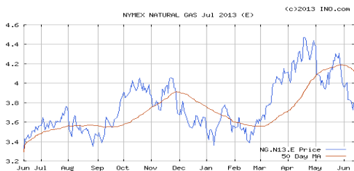
Above Graph – July 2013 NYMEX gas futures

The Crude oil price for July is lower this week at $95.69 per barrel. Heating oil is lower at $2.78 per gal. Unleaded gasoline futures are lower this week at $2.52 and gasoline at the pump is around $3.69...in Indiana. The natural gas storage report this week was an injection of 91BCF; storage is 559BCF lower than last year and 47BCF lower than the 5 year average.