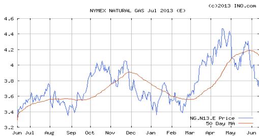
Above Graph – July 2013 NYMEX gas futures

The Crude oil price for July is higher this week at $95.96 per barrel. Heating oil is higher at $2.92 per gal. Unleaded gasoline futures are higher this week at $2.83 and gasoline at the pump is around $4.29...in Indiana. The natural gas storage report this week was an injection of 95BCF; storage is 587BCF lower than last year and 58BCF lower than the 5 year average.