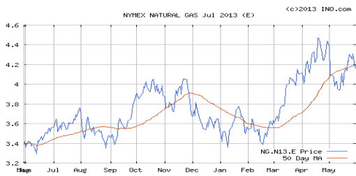
Above Graph – July 2013 NYMEX gas futures

The Crude oil price for July is lower this week at $91.98 per barrel. Heating oil is the same at $2.83 per gal. Unleaded gasoline futures are lower this week at $2.76 and gasoline at the pump is around $3.89...in Indiana. The natural gas storage report this week was an injection of 88BCF; storage is 664BCF lower than last year and 88BCF lower than the 5 year average.