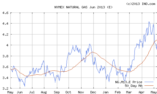
Above Graph – June 2013 NYMEX gas futures

The Crude oil price for June is higher this week at $95.91 per barrel. Heating oil is higher at $2.92 per gal. Unleaded gasoline futures are higher this week at $2.84 and gasoline at the pump is around $3.79...in Indiana. The natural gas storage report this week was an injection of 88BCF; storage is 727BCF lower than last year and 99BCF lower than the 5 year average.