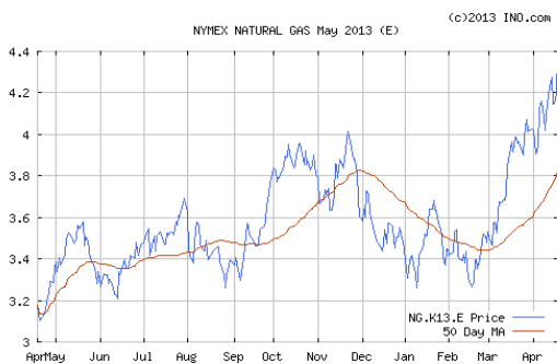
Above Graph – May 2013 NYMEX gas futures

The Crude oil price for May is lower this week at $87.89 per barrel. Heating oil is lower at $2.77 per gal. Unleaded gasoline futures are lower this week at $2.70 and gasoline at the pump is around $3.49...in Indiana. The natural gas storage report this week was an injection of 31BCF; storage is 794BCF lower than last year and 74CF lower than the 5 year average.