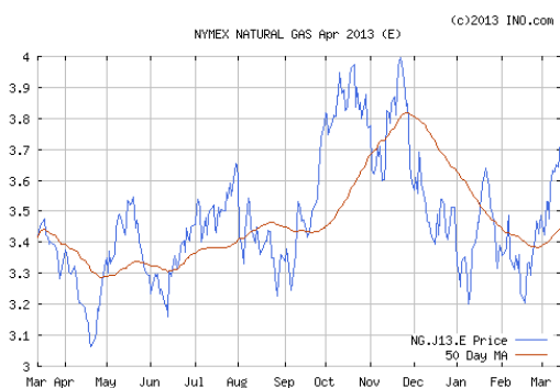
Above Graph – April 2013 NYMEX gas futures

The Crude oil price for April is higher this week at $92.51 per barrel. Heating oil is higher at $3.01 per gal. Unleaded gasoline futures are lower this week at $3.11 and gasoline at the pump is around $3.79...in Indiana. The natural gas storage report this week was a withdrawal of 145BCF; storage is 440BCF lower than last year but 198 BCF higher than the 5 year average.