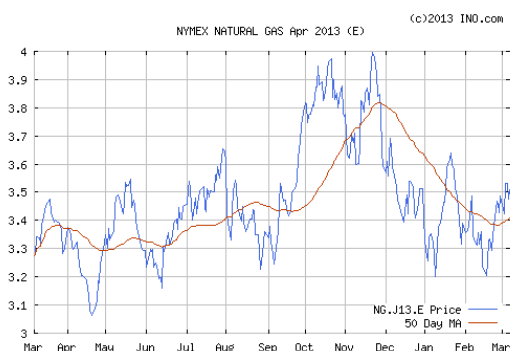
Above Graph – April 2013 NYMEX gas futures

The Crude oil price for April is lower this week at $91.55 per barrel. Heating oil is lower at $2.97 per gal. Unleaded gasoline futures are lower this week at $3.12 and gasoline at the pump is around $3.69...in Indiana. The natural gas storage report this week was a withdrawal of 146BCF; storage is 361BCF lower than last year but 269 BCF higher than the 5 year average.