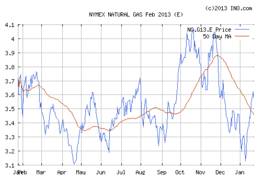
Above Graph – Feb 2013 NYMEX gas futures

The Crude oil price for February is higher this week at $95.92 per barrel. Heating oil is higher at $3.06 per gal. Unleaded gasoline futures are higher this week at $2.84 and gasoline at the pump is around $3.39...in Indiana. The natural gas storage report this week was a withdrawal of 172BCF; storage is 157BCF lower than last year but 320 BCF higher than the 5 year average.