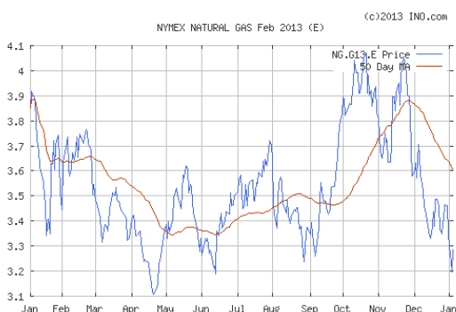
Above Graph – Feb 2013 NYMEX gas futures

The Crude oil price for February is higher this week at $92.67 per barrel. Heating oil is lower at $3.01 per gal. Unleaded gasoline futures are lower this week at $2.76 and gasoline at the pump is around $3.19...in Indiana. The natural gas storage report this week was a withdrawal of 135BCF; storage is 23BCF higher than last year and 389 BCF higher than the 5 year average.