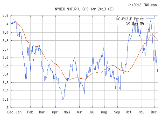
Above Graph – Jan 2013 NYMEX gas futures

The Crude oil price for January is lower this week at $86.11 per barrel. Heating oil is lower at $2.94 per gal. Unleaded gasoline futures are higher this week at $2.61 and gasoline at the pump is around $3.29...in Indiana. The natural gas storage report this week was an injection of 2BCF; storage is 48BCF higher than last year and 283 BCF higher than the 5 year average.