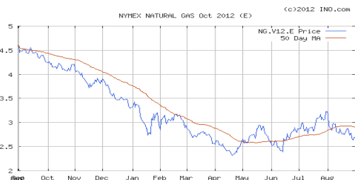
Above Graph – Oct 2012 NYMEX gas futures

The Crude oil price for October is lower this week at $95.13 per barrel. Heating oil is lower at $3.14 per gal. Unleaded gasoline futures are lower this week at $2.92 and gasoline at the pump is around $4.15...in Indiana. The natural gas storage report this week was an injection of 66 BCF; storage is 429CF higher than last year and 361 BCF higher than the 5 year average.