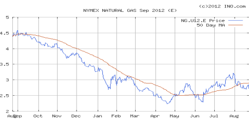
Above Graph – Sep 2012 NYMEX gas futures

The Crude oil price for September is higher this week at $97.73 per barrel. Heating oil is higher at $3.16 per gal. Unleaded gasoline futures are lower this week at $2.96 and gasoline at the pump is around $3.97...in Indiana. The natural gas storage report this week was an injection of 47 BCF; storage is 423CF higher than last year and 357 BCF higher than the 5 year average.