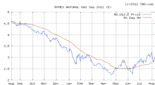
Above Graph – Sep 2012 NYMEX gas futures

The Crude oil price for September is higher this week at $94.03 per barrel. Heating oil is higher at $3.02 per gal. Unleaded gasoline futures are higher this week at $2.98 and gasoline at the pump is around $3.99...in Indiana. The natural gas storage report this week was an injection of 24 BCF; storage is 465CF higher than last year and 386 BCF higher than the 5 year average.