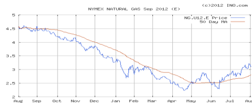
Above Graph – Sep 2012 NYMEX gas futures

The Crude oil price for September is lower this week at $87.28 per barrel. Heating oil is lower at $2.83 per gal. Unleaded gasoline futures are higher this week at $2.84 and gasoline at the pump is around $3.79...in Indiana. The natural gas storage report this week was an injection of 28 BCF; storage is 472CF higher than last year and 407 BCF higher than the 5 year average.