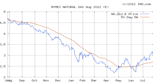
Above Graph – August 2012 NYMEX gas futures

The Crude oil price for August is lower this week at $90.15 per barrel. Heating oil is lower at $2.88 per gal. Unleaded gasoline futures are lower this week at $2.75 and gasoline at the pump is around $3.65...in Indiana. The natural gas storage report this week was an injection of 26 BCF; storage is 487CF higher than last year and 433 BCF higher than the 5 year average.